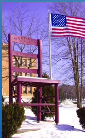
Gardner's Big Chair

Welcome to our bank. To learn more, please explore this Products & Services Brochure, speak to anyone at any CCB branch or logon to our website at www.Colonial4Banking.com .