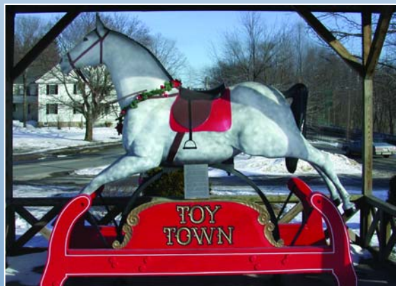
Winchendon's Toy Town Horse